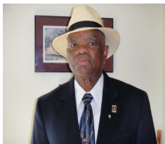
SGM (Ret) USA Military Funeral Honors State Coordinator (904) 827-0630

DISPOSAL CONTACT: According to the Flag Code, any American flag that is worn, damaged or tattered beyond repair should be retired in a respectful and dignified manner. The preferred method is burning. This may shock some, since it is a well known fact that burning the flag is illegal. This, however, is an exception to the rule. You can burn the flag yourself, making sure it is done in a discreet and professional manner, or many organizations like the American Legion, the Boy Scouts Council and the Girl Scouts Council will perform a flag retirement ceremony and burn your flag for you. In this case, burning signifies purification and rebirth. Although burning is the preferred method, it is also acceptable to seal your old flag in a box or bag and bury it. The most important factor is showing respect to the flag during its disposal.