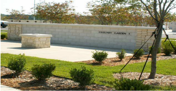
OSSUARY GARDEN I